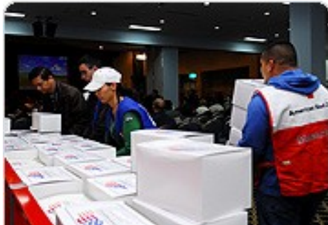
American Red Cross volunteers provide boxed meals to stranded passengers at the Yokota Air Base.