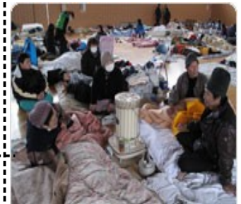
Elderly people in the high school evacuation center in Otsuchi.