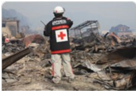
The first team of Japanese Red Cross Society to come into the devastated town of Otsuchi.